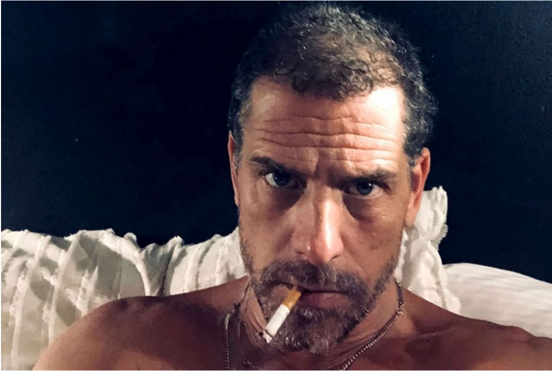
Questions have been raised on what the FBI told Twitter about The Post's Hunter Biden story.